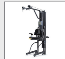
E875MU: Body unweighting system