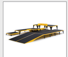
E875MP: Wheelchair ramp, stairs and clinician platform