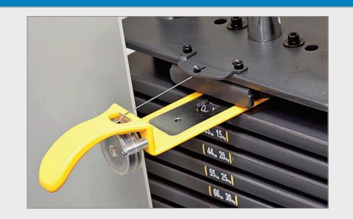
Our stacks feature sound dampeners and magnetized selector fork for maximum stability.