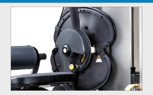
Dual cam system improves biomechanics and reduces cable slack