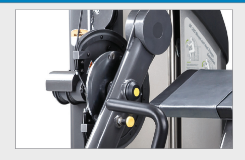
Dual cam system improves biomechanics and reduces cable slack