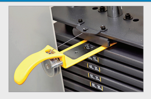
Stacks feature sound dampeners and magnetized selector fork for maximum stability