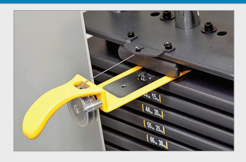
Stacks feature sound dampeners and magnetized selector fork for maximum stability