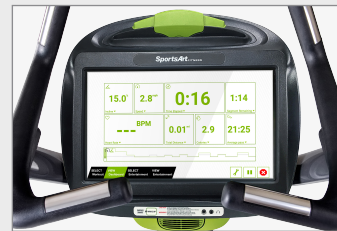
16 in. SENZA™ Touchscreen (Requires Power)