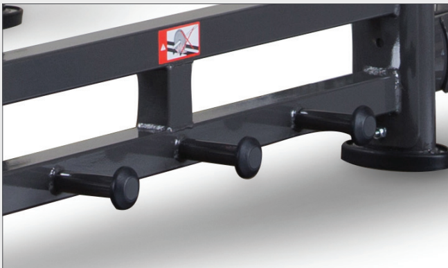
Resistance band pegs